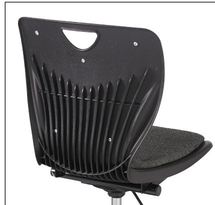
Back of Contemporary Chair

From the contoured A to extra-wide A+ size polypropylene seat with a waterfall edge, down to the movable foot ring and swiveling 5-star base set on casters, this ergonomic chair goes to great (adjustable) heights to offer ease and mobility in your flexible classroom. The pneumatic seat can be raised or lowered between 24 and 34 inches to suit any user's personal leg space or seating position, while the armless design provides plenty of room to stretch and move the elbows and hips. Great for Grade 5 students to adults, this mobile chair can be used with a higher desk or lab table for posture support that is surprisingly comfortable (and always adjustable).