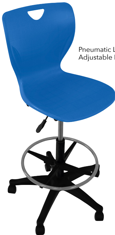
Pneumatic Lift Stool with Adjustable Foot Ring